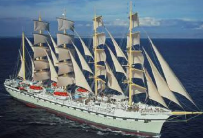
The world's largest square-rigged passenger ship