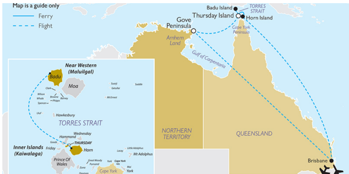
Tropical paradise in East Arnhem Land