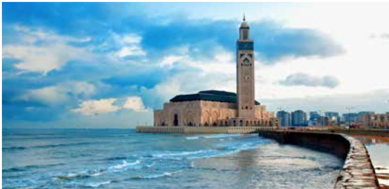
Hassan II Mosque in Casablanca, Morocco