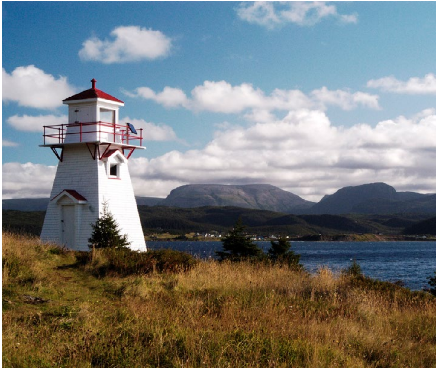
Woody Point Lighthouse looking over Bonne Bay toward Gros Morne mountain in the distance