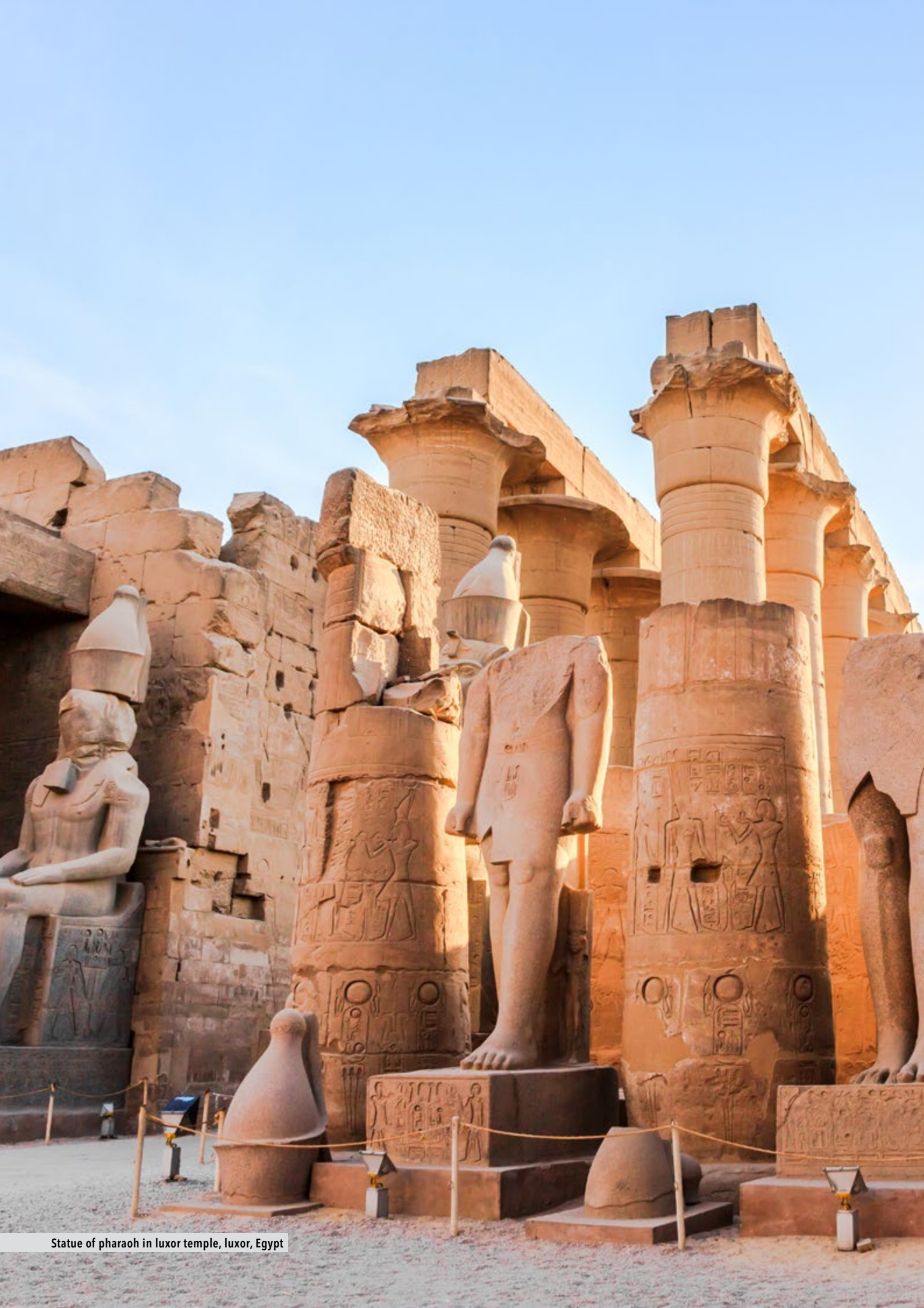
Statue of pharaoh in luxor temple, luxor, Egypt