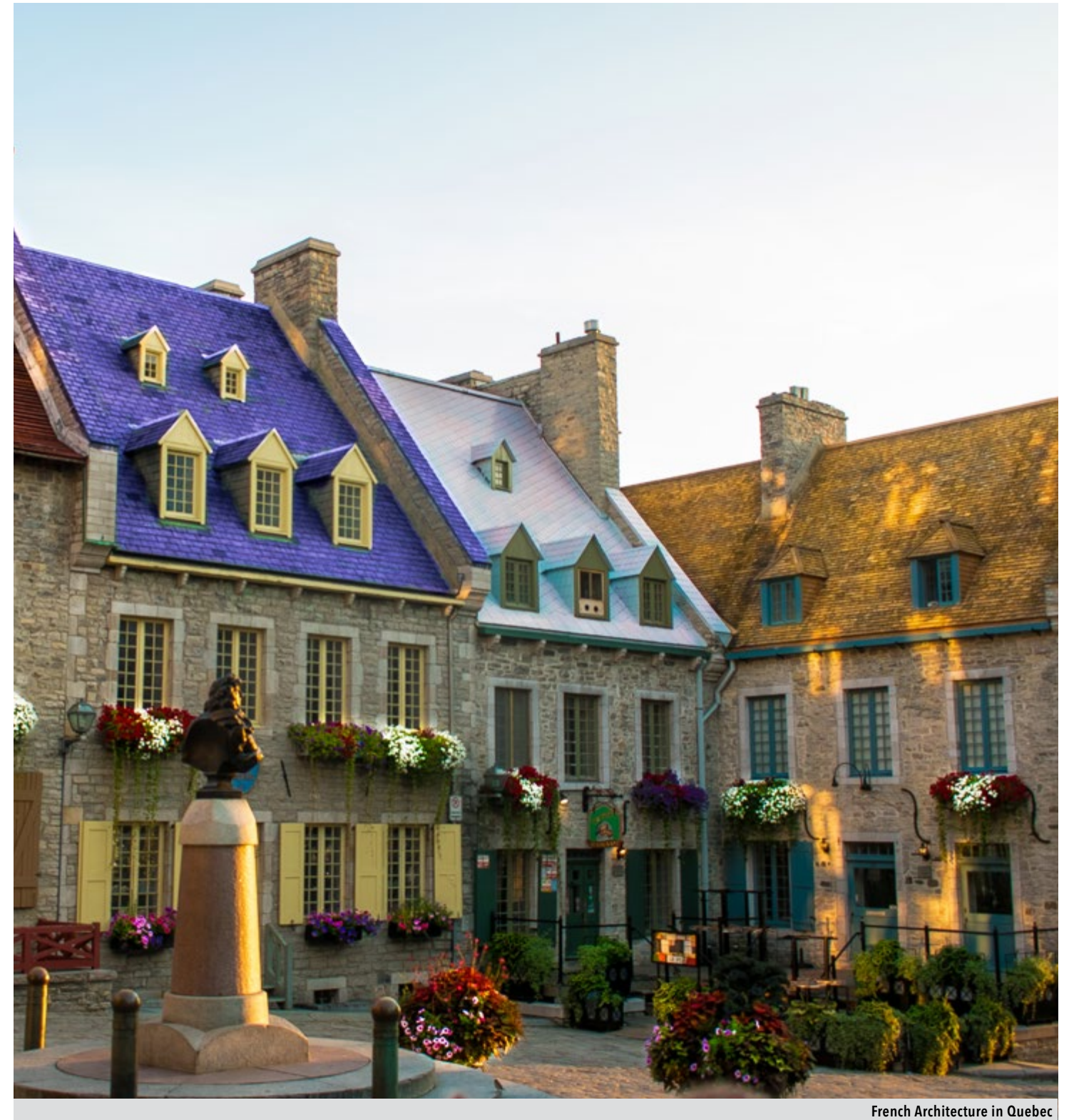
French Architecture in Quebec

Welcome to our first ever season of summer sailings in Canada and New England. This year we wanted to experience the region during the warmer months and we wanted to do it aboard our lovely Silver Shadow. We have added a special focus on the northern part of the region, visiting Newfoundland in northern Canada. The long days will allow us greater discovery of the region, permitting us to offer guests a vast spectrum of scenic variety. We have also added longer stays in Boston, meaning you can enjoy the epic fall foliage at your leisure. 2023/2024 is the season to polish up your French! We will be returning to Montreal after a long hiatus. If you like included shore excursions, a choice of ocean-going and expedition itineraries and the promise of scenically spectacular vistas, then this is the region for you.