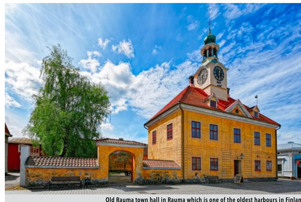
Old Rauma town hall in Rauma which is one of the oldest harbours in Finland

“We have worked hard to design new itineraries that take off-beaten-path, luxury travel to new heights. From unearthing remote destinations on the northern Finnish coast to late-season Norwegian Fjords cruises, our team of experts has made the impossible a reality.”