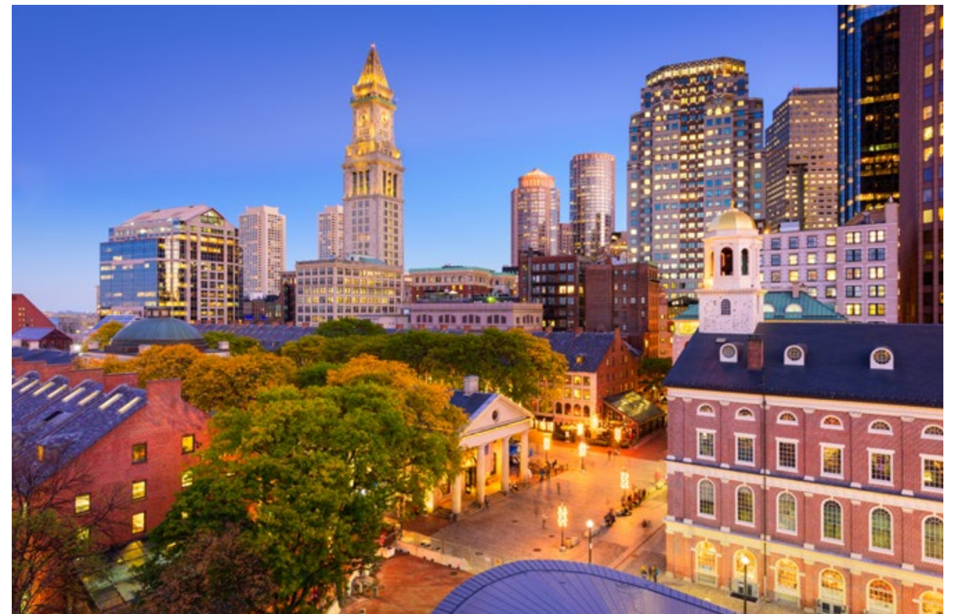
Boston, Massachusetts, USA

"I am delighted to announce our first ever summer season in Canada and New England. This innovation will allow us to explore the coasts of Newfoundland and offer guests an authentic travel experience like never before."