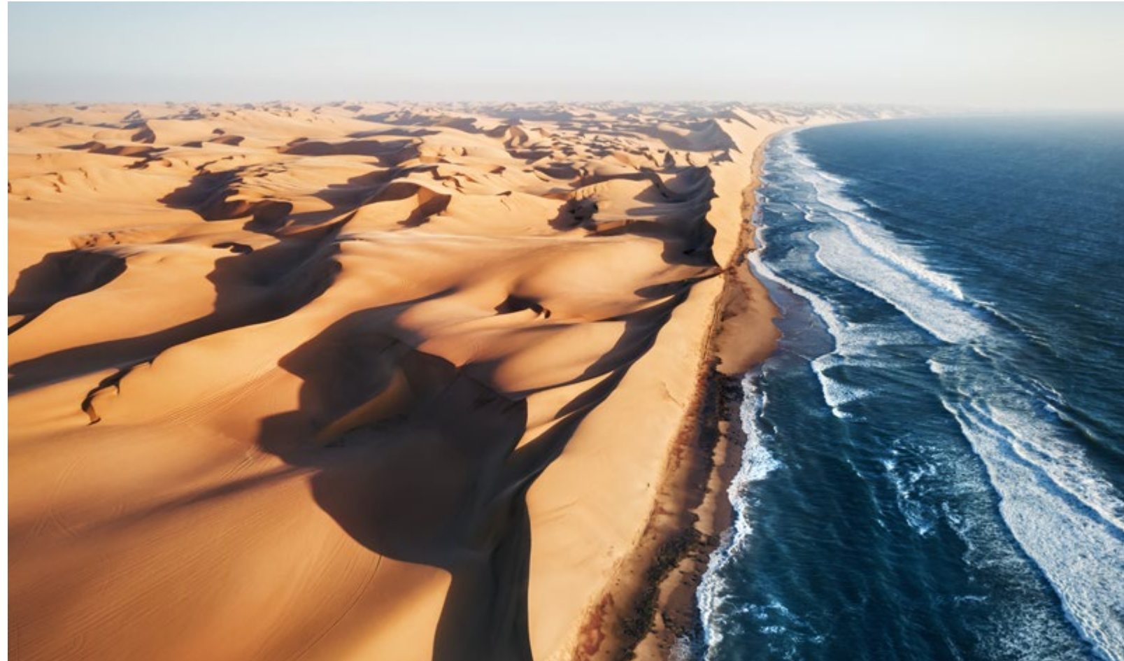
Place where Namib desert and the Atlantic ocean meets, Skeletoncoast, South Africa, Namibia