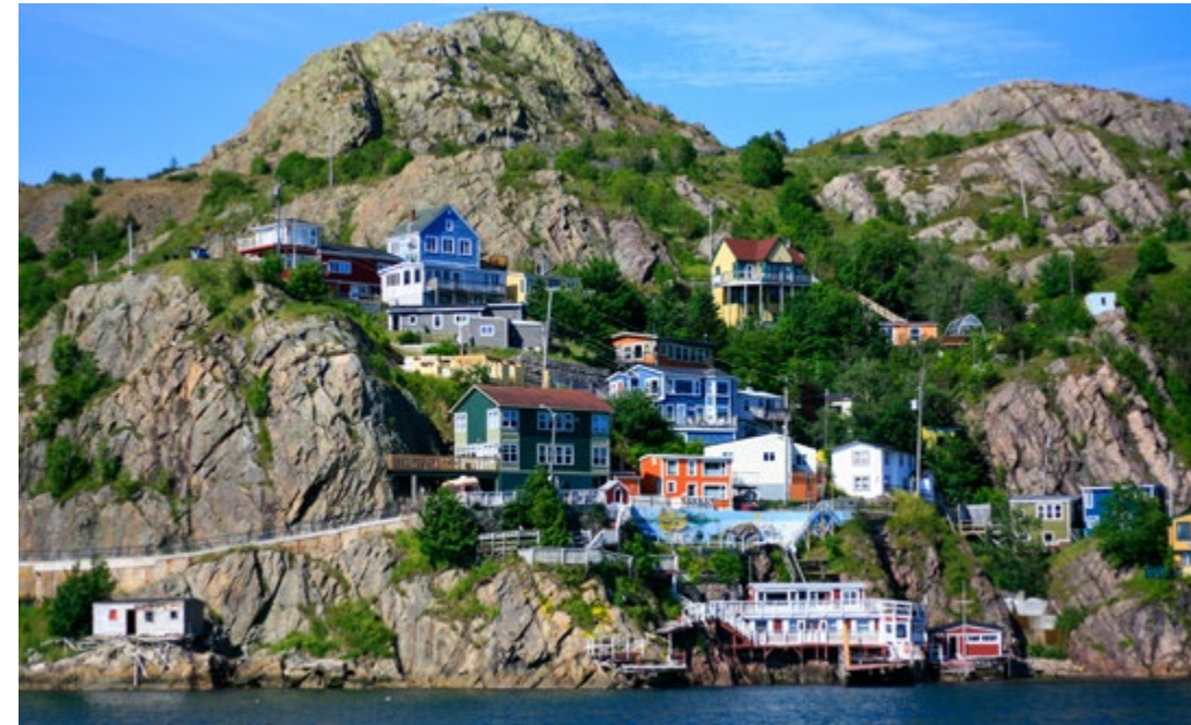
Colorful houses located on the hill in St. John's, Newfoundland