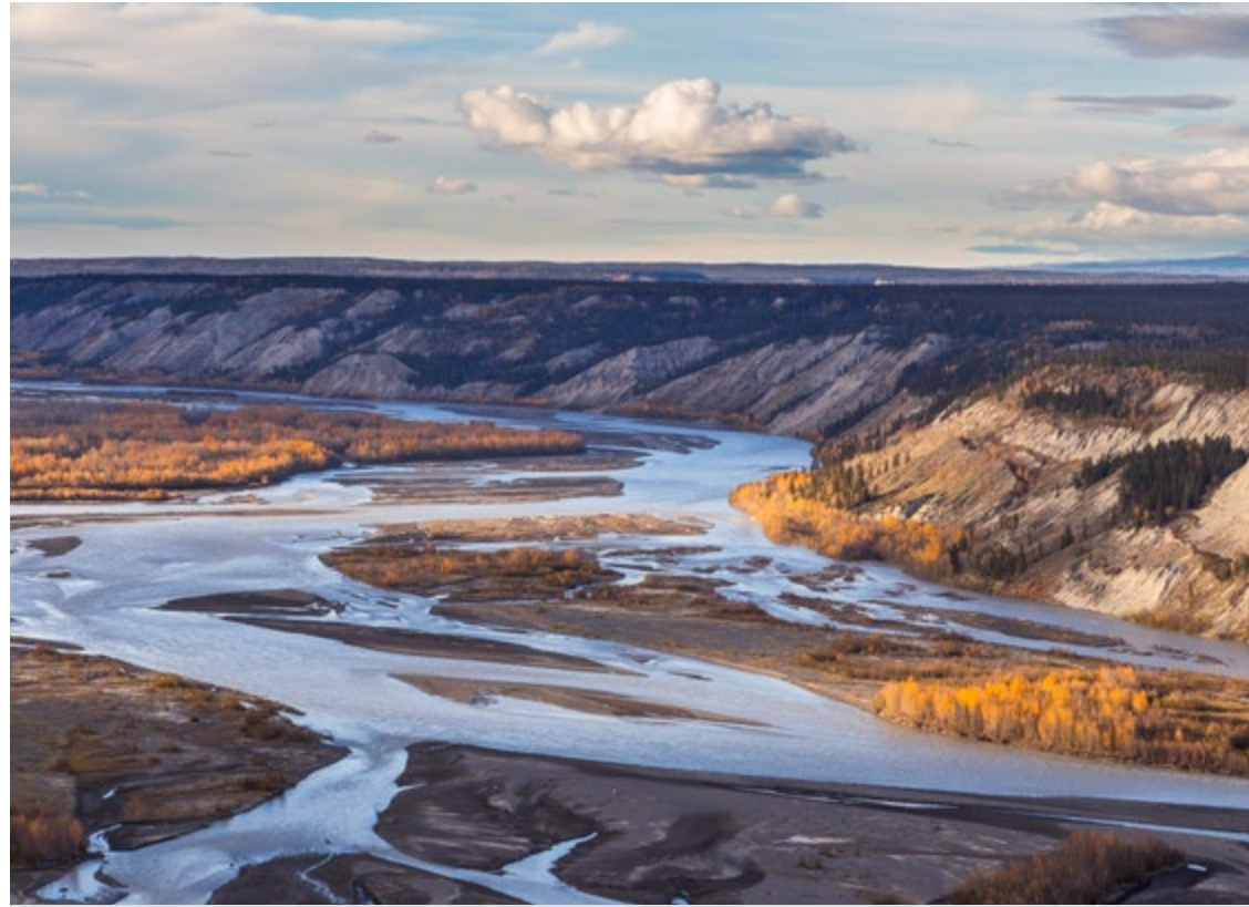
Wrangell-St. Elias National Park and Preserve is one of the highlights of our itinerary

“To say Alaska and the Russian Far East are scenically spectacular is no understatement. These itineraries allow guests to enjoy new destinations in a region that is an extraordinary fusion of wildlife, heritage and nature.”