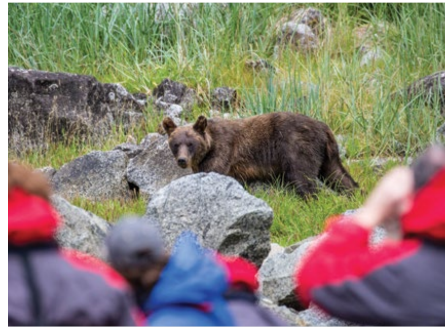
Brown bears and wildlife watching is the top highlight of our Alaska cruises