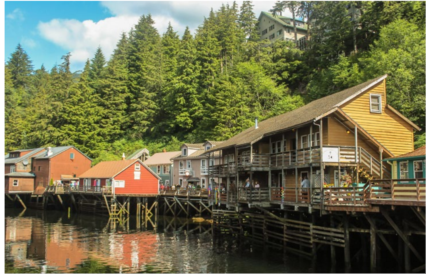
Our Alaska itineraries visit the beautiful Skagway