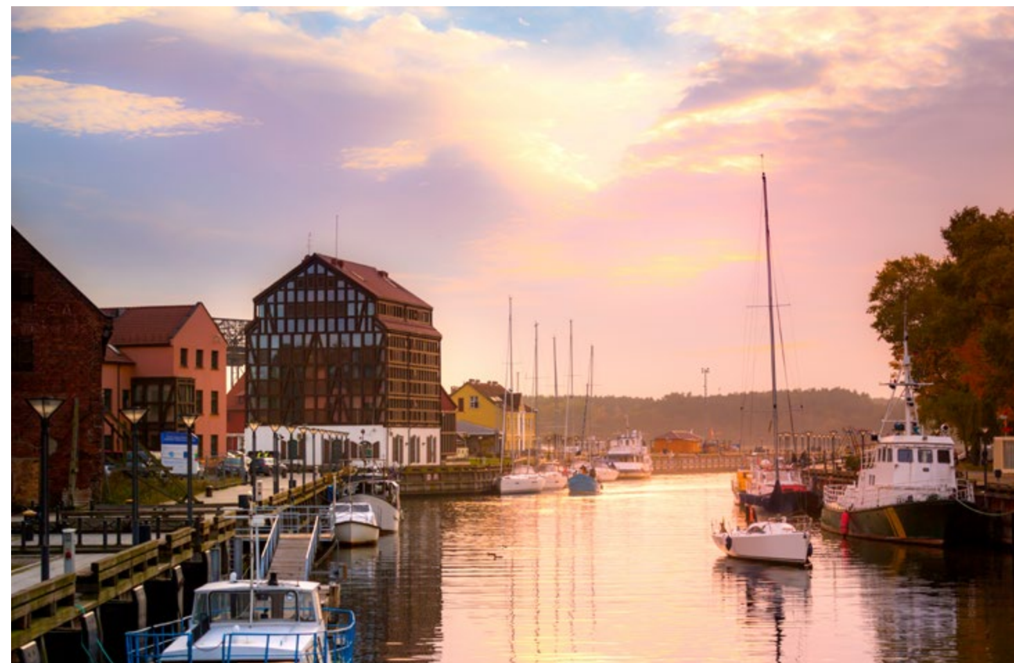
Sunset in the harbor. Klaipėda, Lithuania