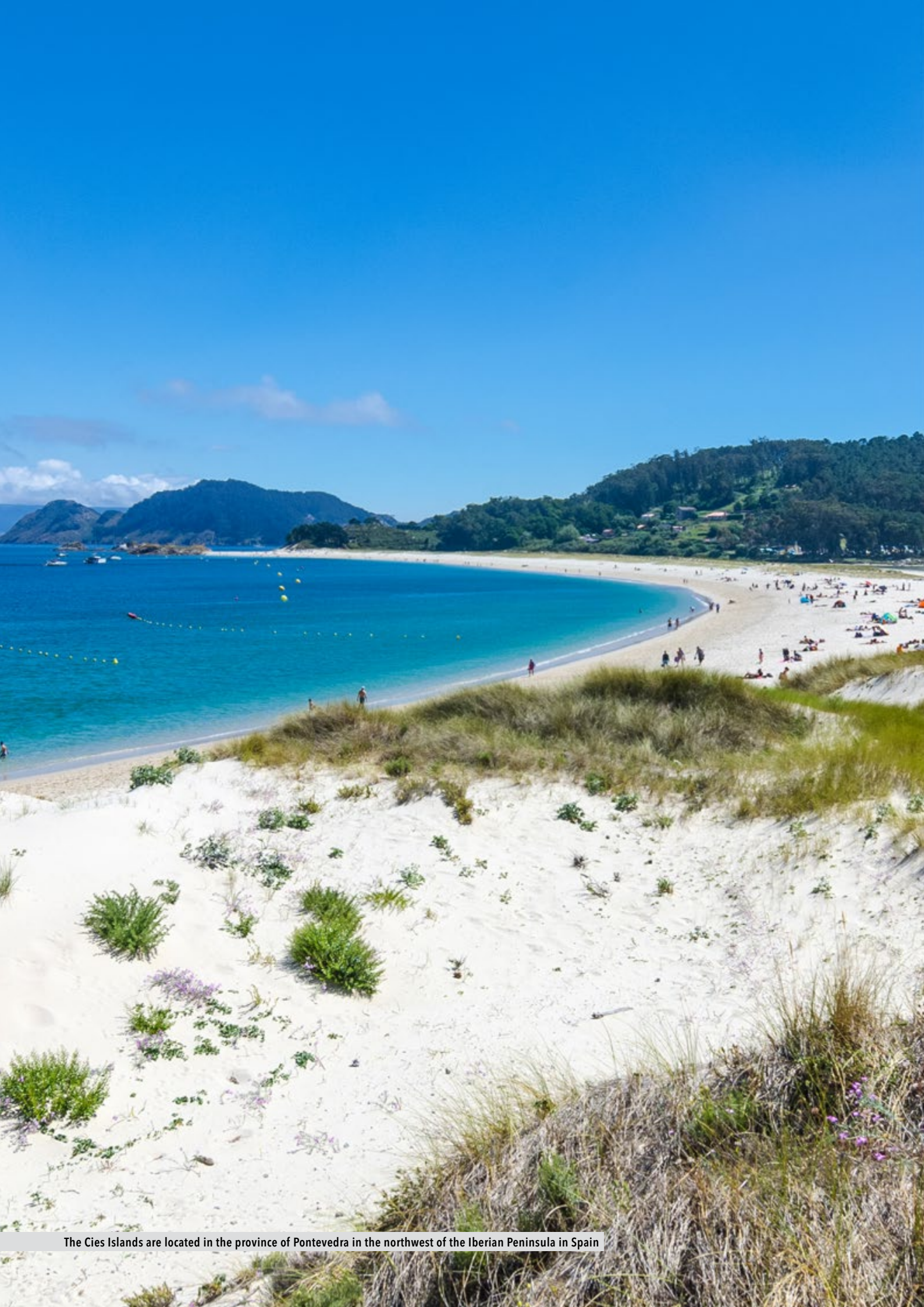
The Cies Islands are located in the province of Pontevedra in the northwest of the Iberian Peninsula in Spain