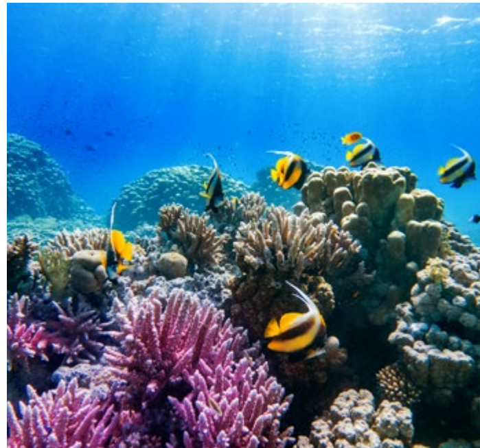
Colorful corals and exotic fishes at the bottom of the Red Sea