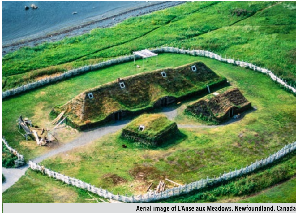
Aerial image of L'Anse aux Meadows, Newfoundland, Canada

Welcome to our first ever season of summer sailings in Canada and New England. This year we wanted to experience the region during the warmer months and we wanted to do it aboard our lovely Silver Shadow. We have added a special focus on the northern part of the region, visiting Newfoundland in northern Canada. The long days will allow us greater discovery of the region, permitting us to offer guests a vast spectrum of scenic variety. We have also added longer stays in Boston, meaning you can enjoy the epic fall foliage at your leisure. 2023/2024 is the season to polish up your French! We will be returning to Montreal after a long hiatus. If you like included shore excursions, a choice of ocean-going and expedition itineraries and the promise of scenically spectacular vistas, then this is the region for you.