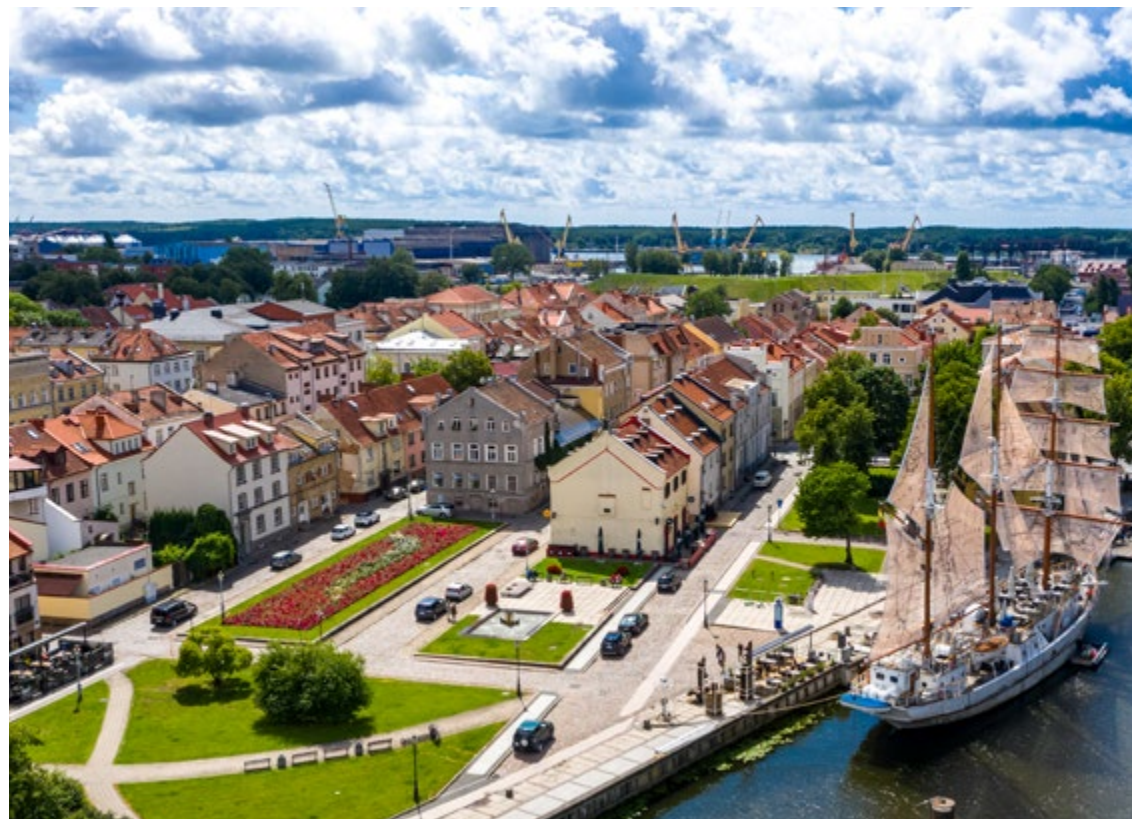
The educational vessel in Klaipėda