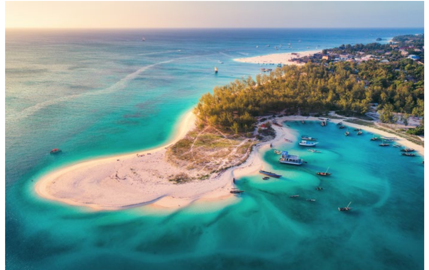
Aerial view of the fishing boats on tropical sea coast, Zanzibar

Africa and the Indian Ocean offer a world of sensations. This is a region that spills over with natural beauty, wherever you look. Think whale watching and safari games [ZR1] in South Africa, going off-grid in Saudi Arabia and fabulous snorkelling in the Seychelles. This season our pioneering spirit will lead us to the Comoros islands for the first time, as well take us on multiple voyages to the Arabian Peninsula for complete immersion of this mysterious destination. But that's not all! Our extensive itineraries are now even better than ever. We've added brand new destinations that offer in depth discovery of the Red Sea, extended stays in the Persian Gulf, multiple UNESCO World Heritage Sites and a cornucopia of experiences so you can really discover this fascinating region.