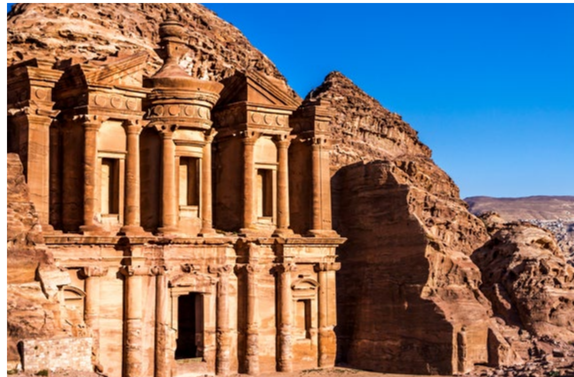
The Monastery - Petra, Jordan

“This is an epic voyage that truly showcases vast bio diversity while simultaneously exploring the virgin territory and ancient landscape of a spectacular continent.”